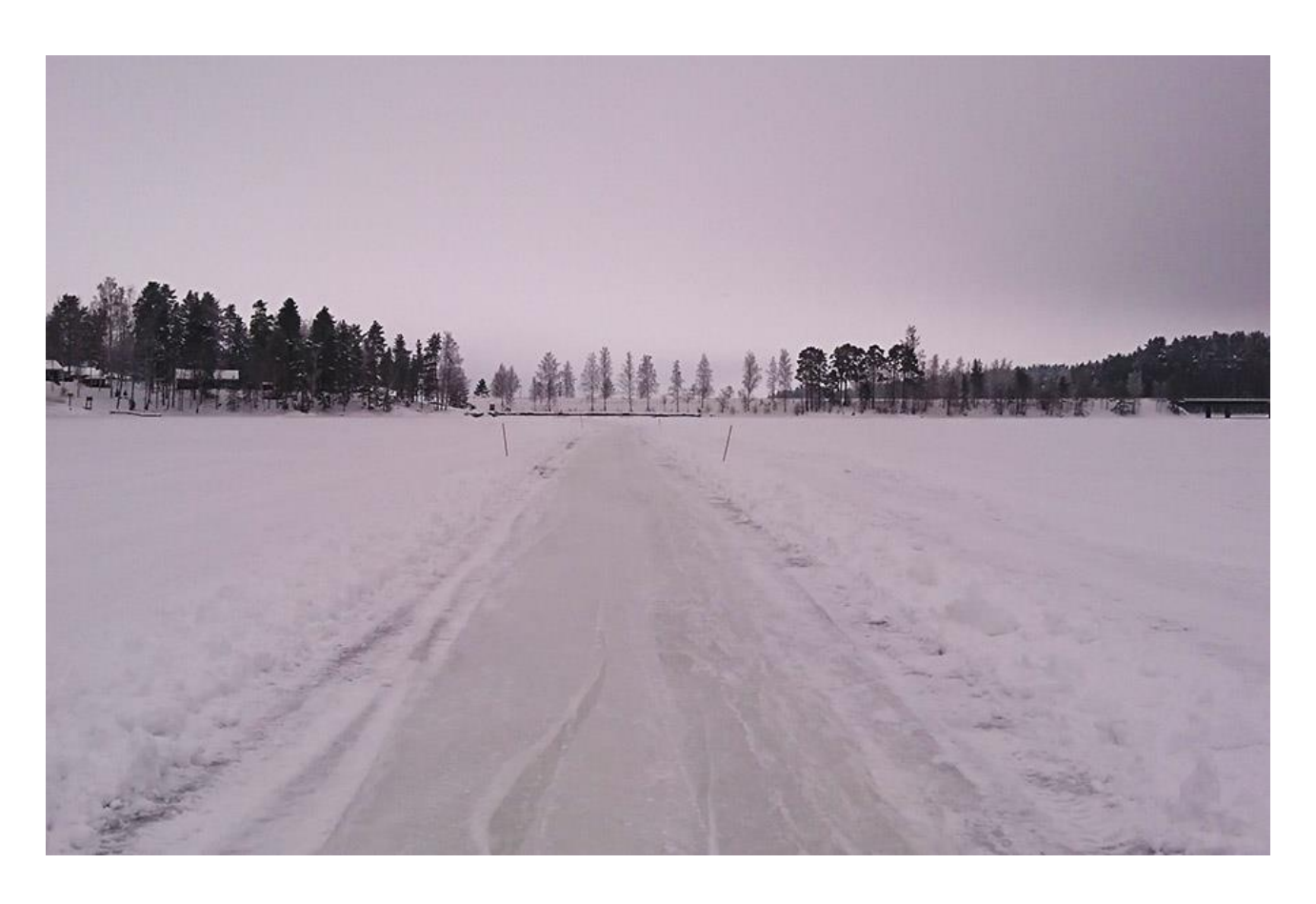
WED 9.1. PREPARATIONS ARE ON

Working hard to re-open the tracks (we have to start from skratch now), if lucky with the weather there might be some parts of skating tracks opened again in few days! Not the simpliest start of season. :)