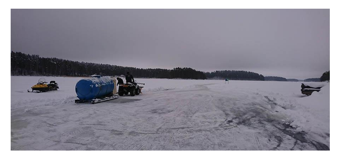
SAT 5.1.2019 SKATING CLOSED, GREAT CONDITION FOR SKIING AND SNOWSHOEING

Working hard to re-open the tracks (we have to start from skratch now), if lucky with the weather there might be some parts of skating tracks opened again in few days! Not the simpliest start of season. :)