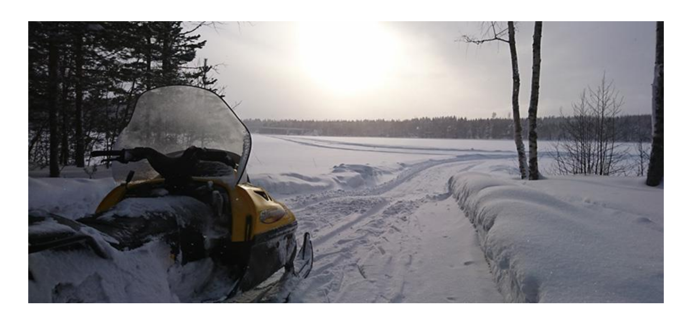
MON 2.2. AT 11.00

Tracks have been cleared from snow, 10 km of good tracks open!